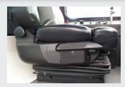
Seating - New driver's seat features state of the art air suspension systems with multiple adjustments for optimum driver comfort.