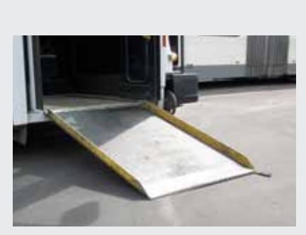
Wheelchair Ramp Overhaul - Wheelchair lifts or ramps are completely remanufactured