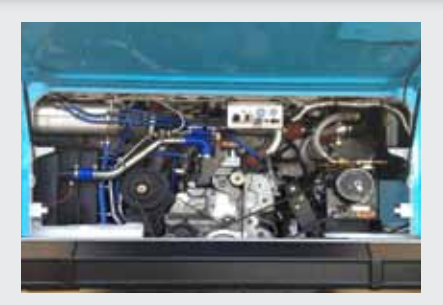
Engine and Transmission - Remanufactured engines and transmissions, new radiator and CAC package and remanufactured engine components assure safe reliable operation as well as EPA emission compliance