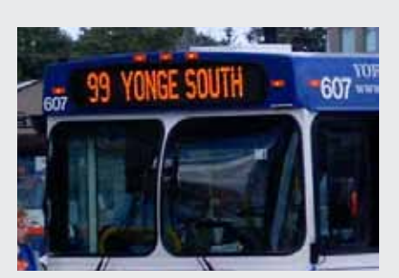
Destination Sign - New state of the art LED sign systems including front, side and rear destination signs assure ADA compliance